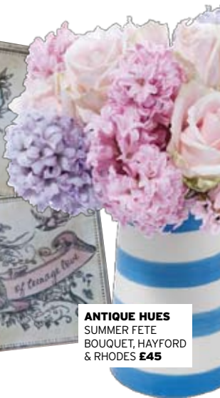
ANTIQUE HUES SUMMER FETE BOUQUET, HAYFORD & RHODES £45