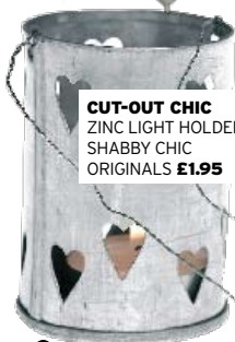
CUT-OUT CHIC ZINC LIGHT HOLDER, SHABBY CHIC ORIGINALS £1.95