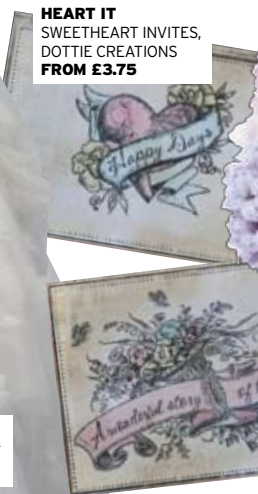
HEART IT SWEETHEART INVITES, DOTTIE CREATIONS FROM £3.75

Get Tracy and Bobby's retro-chic look with these beautiful buys