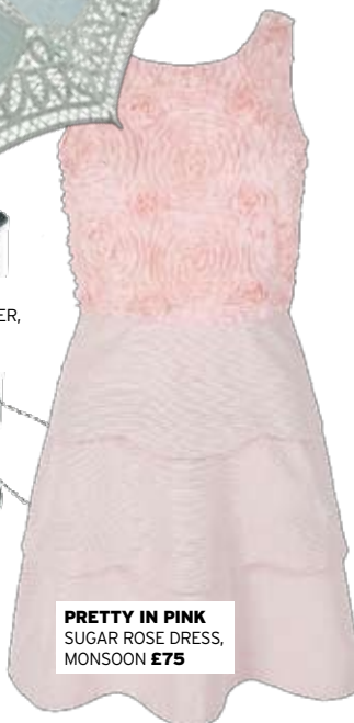
PRETTY IN PINK SUGAR ROSE DRESS, MONSOON £75