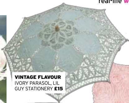
VINTAGE FLAVOUR IVORY PARASOL, LIL GUY STATIONERY £15